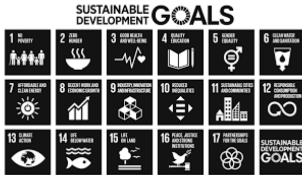
Figure 1: The 17 UN Sustainable Development Goals

Design thinking is often seen as a key literacy and a form of problem-based-learning as it requires active participation in meaning-making and knowledge-creation. In this project students will engage with 'wicked' societal problems by using Design thinking to find a solution to an issue associated with one of the 17 UN Sustainable Development Goals (Figure 1).